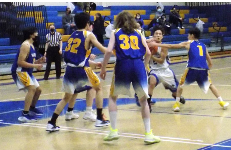
JV Warriors play a tough scrimmage last weekend, displaying effective offense and defense.